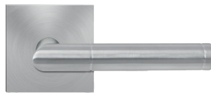
Rio Steel – UEPL34Q 2 9/16 x 2 9/16 x 1/8"