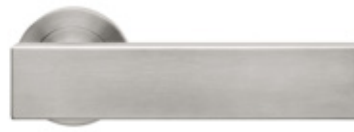
Milano- TER 52 Ø 2 1/16" x 7/16"