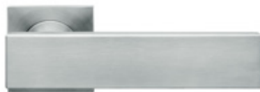
Milano- TER 52Q 2 1/16" x 2 1/16"